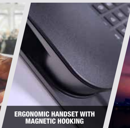
ERGONOMIC HANDSET WITH MAGNETIC HOOKING