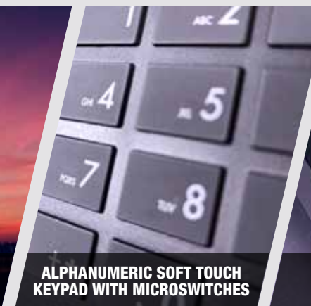
ALPHANUMERIC SOFT TOUCH KEYPAD WITH MICROSWITCHES